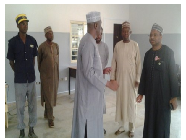
DG/CEO during inspection at the newly built Katsina State Office complex

He reminded the team of the Commission's mandate which is to provide sustainable world-class identity management solution to affirm identity, encomplex.