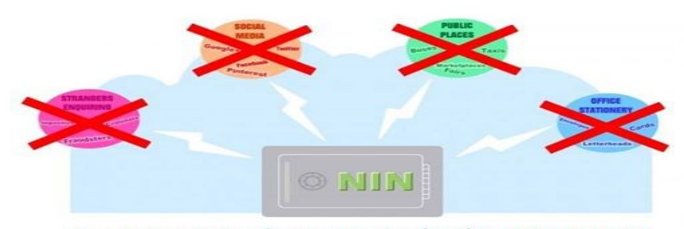
Your National Identification Number (NIN) is CONFIDENTIAL DO NOT EXPOSE IT IN PUBLIC UNNECESSARILY!