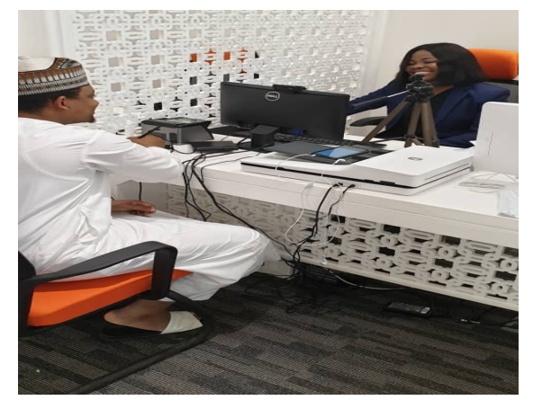
Diaspora enrolment commences at the NIN enrolment center in UAE, Dubai