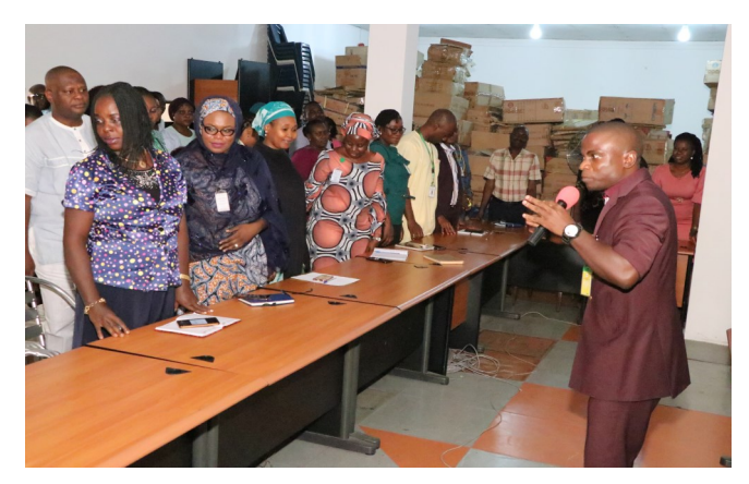
A Cross Section of NIMC Staff participating in Physiotherapy Training at the NIMC Training center, held recently in Abuja.