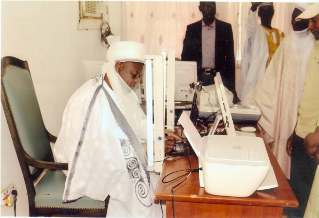
The Sultan of Sokoto, Alhaji Mohammad Sa'ad Abubakar III enrolling for his National Identification Number (NIN) at the NIMC enrolment Centre at the Sultans Palace in Sokoto State recently.