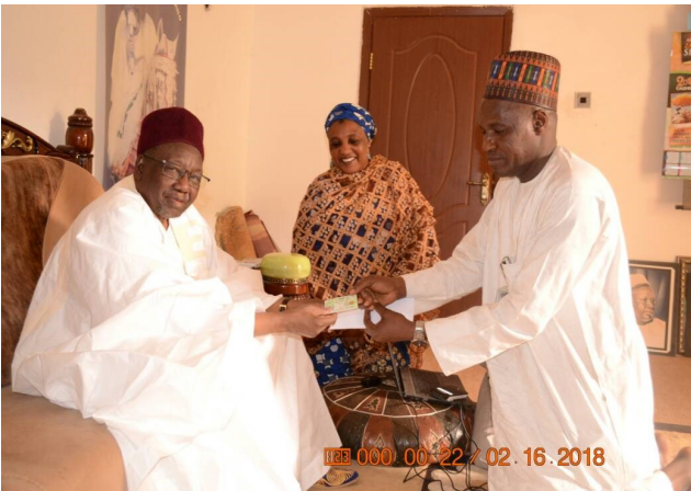
The Shehu of Borno, Alhaji Abubakar Ibn Umar Garbai Al-Amin El-Kanemi recently received his National e-ID Card from the Borno State Coordinator at his Palace.