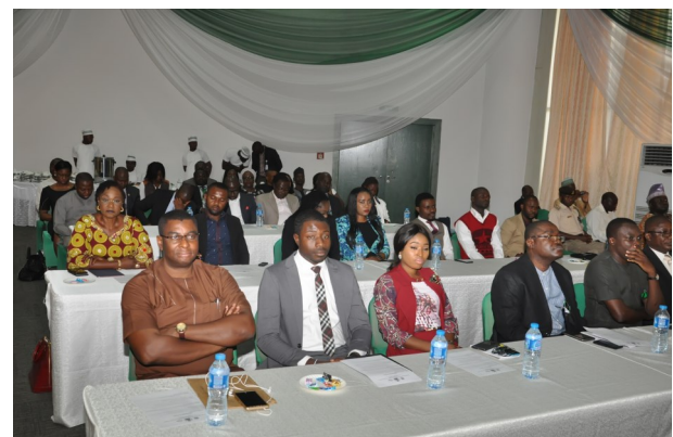
Cross-Section of Stakeholders at the one-day Workshop