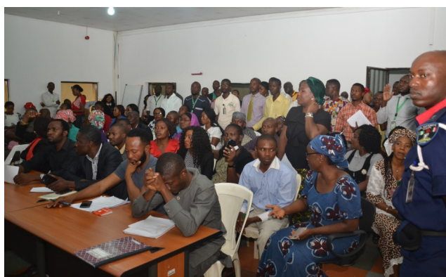
Cross Section of Members of the NIMC Multipurpose Cooperative Society, during the 2017 Annual General Meeting (AGM) held at the NIMC training Centre in December.