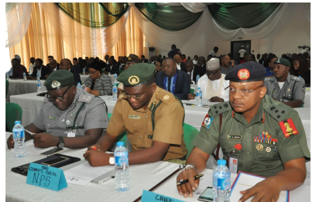
(L-R) - Representatives from the Nigerian Army, the Nigeria Prison Service and the Nigeria Customs