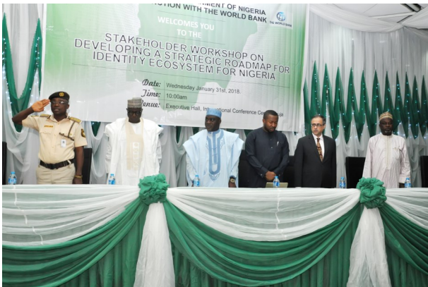
Discussants at the one day stakeholders workshop