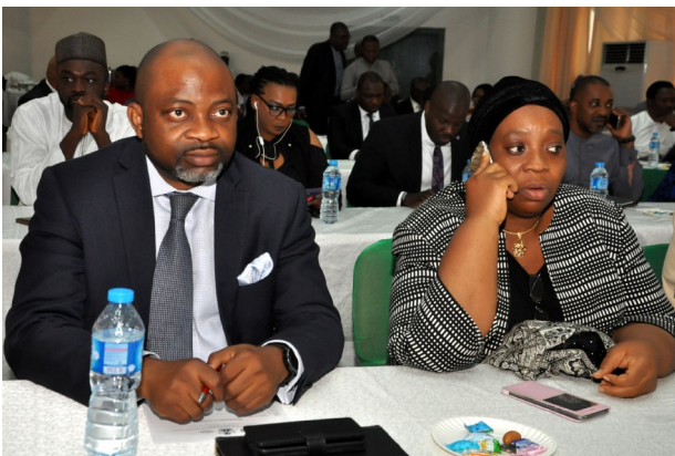
Cross-Section of Stakeholders at the one-day Workshop