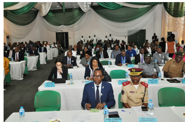
Cross-Section of Stakeholders at the one-day Workshop