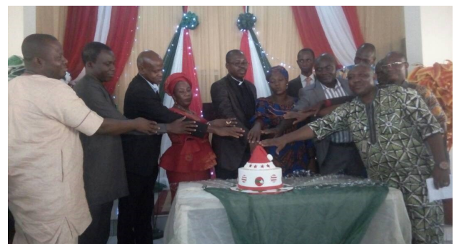
NIMC Christian Fellowship (Inter denominational) during the 2017 end of year thanksgiving at the NIMC Chapel, Abuja.