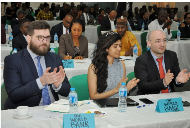
World Bank Representatives at the Workshop