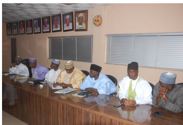
Cross-section of the Committee members at the Inauguration Ceremony

man committee, assured that he will collaborate with the committee to ensure that they mobilize the residents of the state to come out for enrolment.