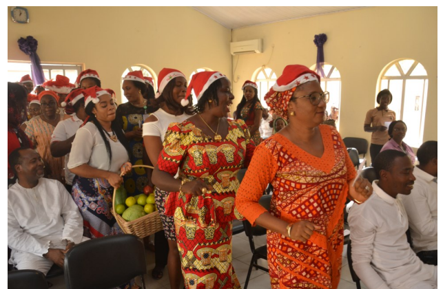
NIMC Catholic Community during the 2017 end of the year thanksgiving and Christmas Carol at the NIMC Chapel, Abuja.