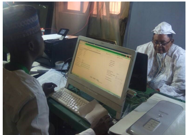
The Alaaafin of Oyo, Oba Lamidi Olayiwola Adeyemi III recently registered for his National Identification Number (NIN) at the NIMC State Office in Oyo State.