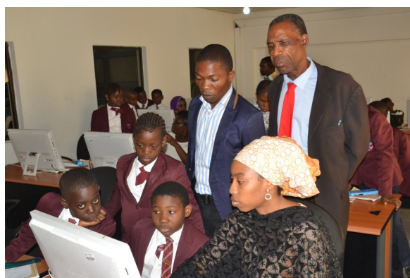
Primary 5 pupils of Christabel Primary School, Wuye on excursion to the Commission being educated by a staff of Biometrics Unit.