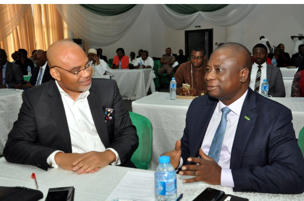
Cross-Section of Stakeholders at the one-day Workshop