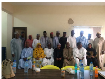
NIMC Kano Staff with KANO LEAD Members