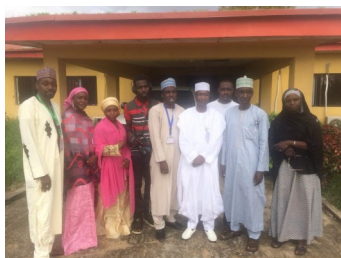
NIMC Kano team led by Kano State Coordinator with Staff of Arewa24 TV Station after an interview with the State Coordinator.