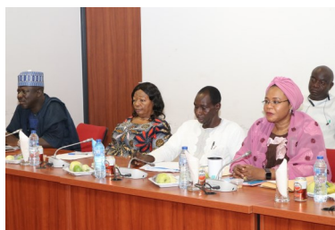
CROSS SECTION OF SOME NIMC MANAGEMENT STAFF AT THE PRESENTATION OF THE 2020 BUDGET.