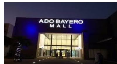
Ado Bayero Mall, Kano, Kano

FORGOT YOUR NIN? National Identification Number