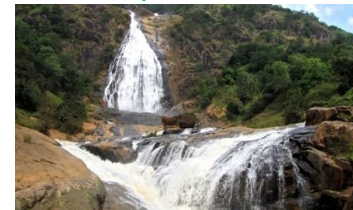
Farin Ruwa Waterfalls, Nassarawa