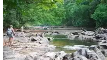
The Lamurde Hot Spring, Adamawa