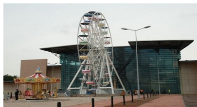
Polo Park Mall, Enugu, Enugu