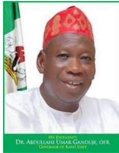
His Excellency DR. ABDULLAHI UMAR GANDUJE, OFR GOVERNOR OF KANO STATE

The Executive Governor of Kano State, Dr. Abdullahi Umar Ganduje, has emphasized the importance of the National Identification Number (NIN), noting that it is crucial to the excellent performance of all sectors of the economy in Nigeria.