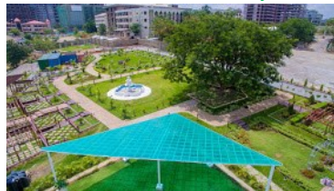
The Central Park, Abuja