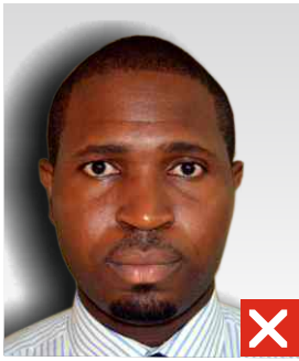
shadows behind head