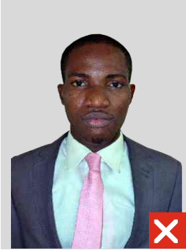
too far away