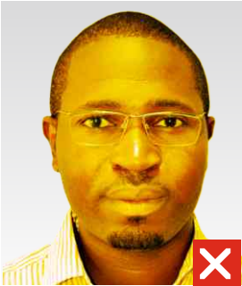
unnatural skin tones