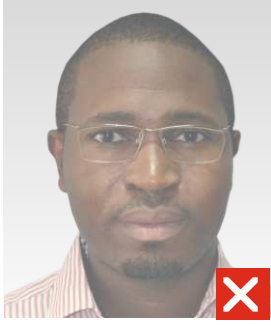
washed out colour